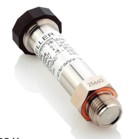
Series 35 X G1/2", flush diaphragm